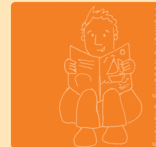
Premier's Reading Challenge