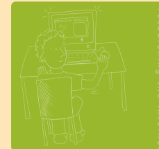
researching the internet