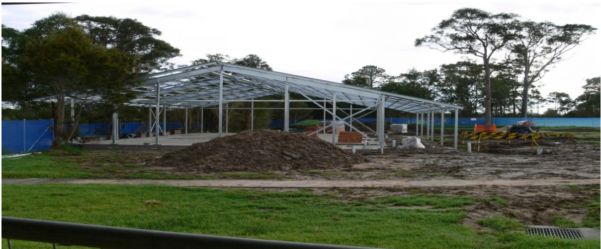
1 The view from our classroom.

This term has seen a few changes around Wadalba Community School. A new fence now surrounds the school, keeping us all safe and a new building is going up adjacent to our classroom. The students have enjoyed watching the progress and have shown a great deal of maturity in blocking out construction noise and concentrating on the job at hand.