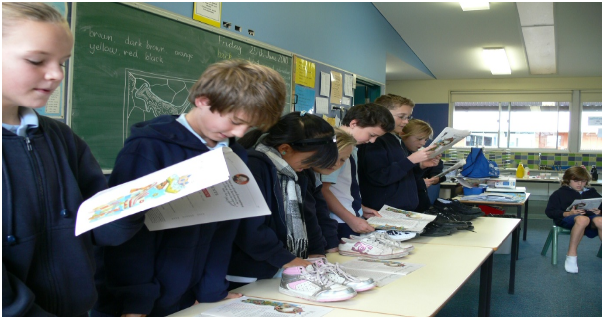
2 Drama - Which shoes do you choose?