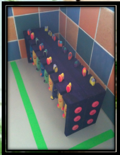
The teeth brushing and oral health Program has been highly successful.