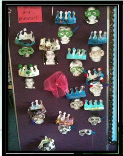
Our crowns and masks designed during Creative Arts (Visual Art) lessons.