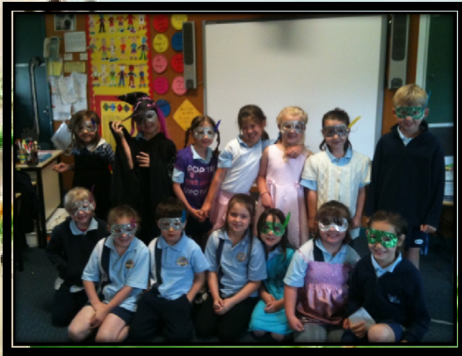
12M's princes and princesses. They performed to perfection.