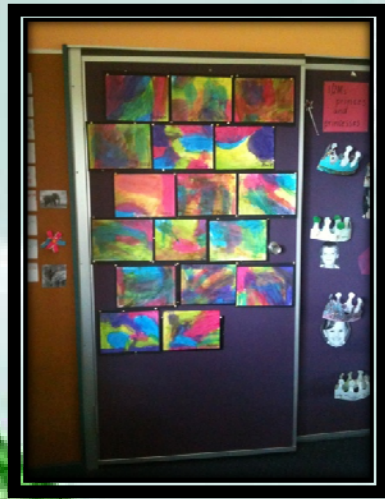
Abstract art - Exploring primary and secondary colour.