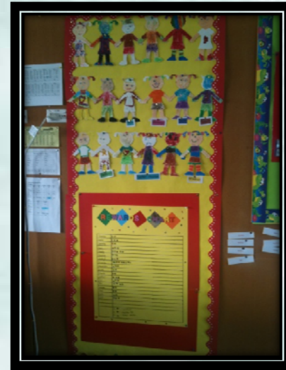
Creating our identities.